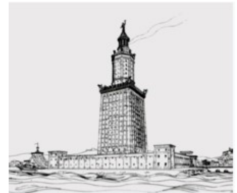
A drawing of the first lighthouse: